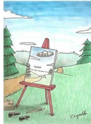
The disappearing artist

Thank goodness SASA's constitution states that our president should serve a maximum of 3 years then hand over to a new person ... and that is the right way to keep our society fresh and vibrant with a strongly beating heart. Perhaps that's one reason why we now have 500 members and they only have 60!